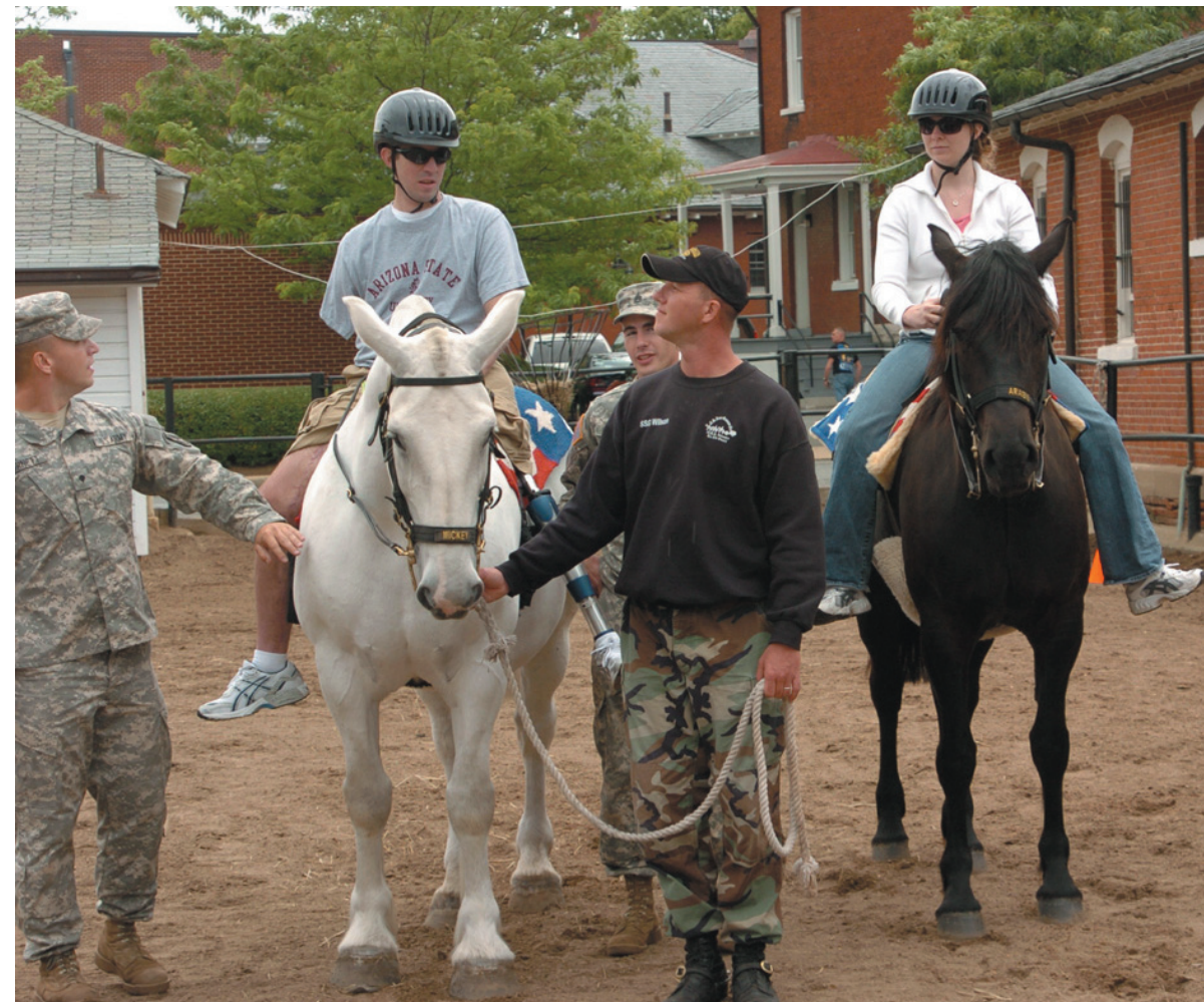
War Veterans & Horses at Healing Reins

that include team building and self-awareness exercises, which aid in discovering what could be holding an individual back from a full recovery.